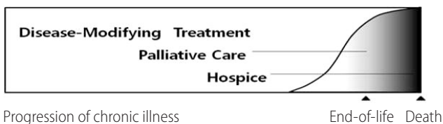
Figure 1. Conceptual frame of disease-modifying treatment, palliative care, and hospice.

Advance care planning is a process for patients at all stages of